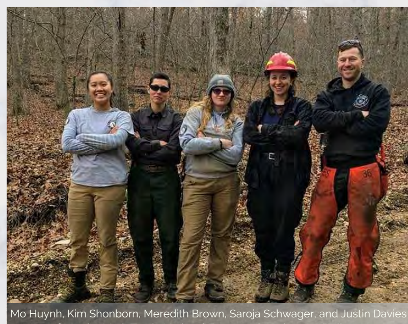
from the Mark Twain National Forest at Grasshopper Hollow